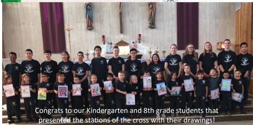
Congrats to our Kindergarten and 8th grade students that presented the stations of the cross with their drawings!

To schedule a tour, call (708) 424-7757 or visit our website at: www.stalbertthegreatschool.com