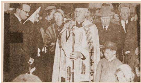
Dedication of the new St. Albert the Great Church, October 3, 1966