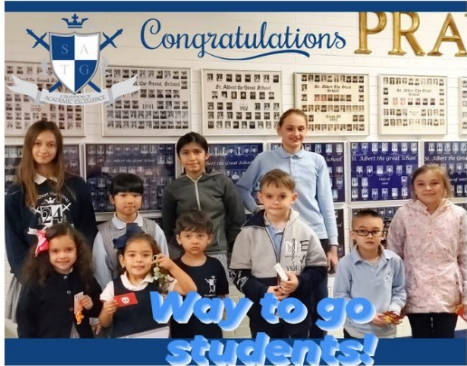
Congratulations to our way to go Students! Keep up the fantastic work!